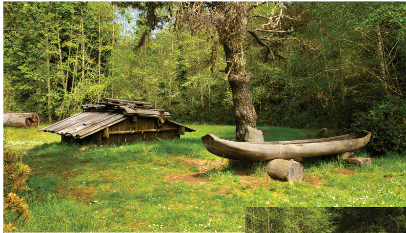
Sumêg Village. Above: Canoe and plank house; Right: Sweathouse

and pine. Spring and summer wildflowers include Douglas iris, fairy bells, trillium, skunk cabbage, azalea, and rhododendron. Thimbleberries, salmonberries, and huckleberries are found along meadow edges. Fall and early winter bring out a wide variety of mushrooms, which may be viewed but may not be picked.