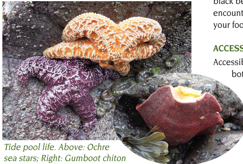
Tide pool life. Above: Ochre sea stars; Right: Gumboot chiton

Accessible campsites are available in both the Abalone and Agate Beach campgrounds. Accessible restrooms with coin showers are nearby. The visitor center is generally accessible, with designated accessible parking and restrooms nearby.